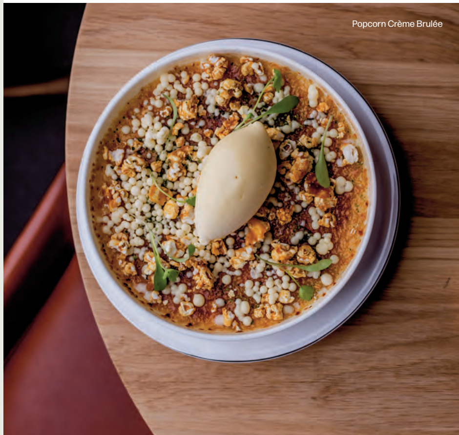
Popcorn Crème Brûlée